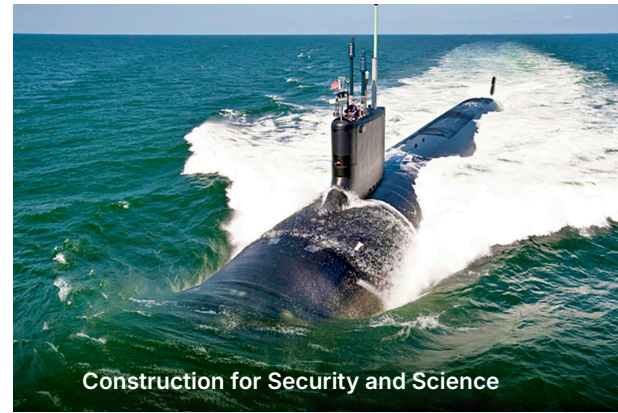
Construction for Security and Science

Let's discuss how we can bring more value to your next project.